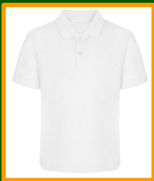
white polo shirt