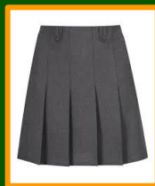
grey skirt or shorts (knee length)