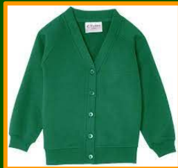
green jumper or cardigan