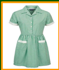
green and white gingham dress